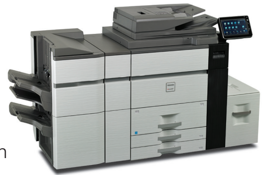
Even the smallest configurations offer exceptional speed, reliability and performance.

Increasing production while decreasing the time it takes can make a big difference for businesses of all sizes. When the demand is great, Toshiba offers a solution that's even greater.