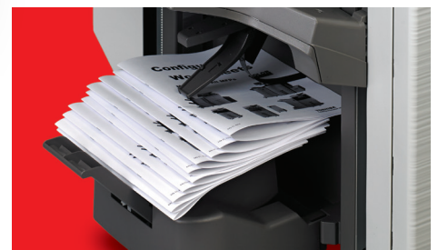
A large 250-sheet Duplex Single Pass Feeder (DSPF) handles your biggest jobs with ease. Also take advantage of a number of finishing options to produce professional looking brochures and booklets.