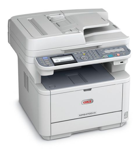
The compact MPS4700mb MFP features an 8.5" x 14" flatbed scanner, as well as a 50-sheet reversing/duplex automatic document feeder (RADF) that scans both sides of a document.