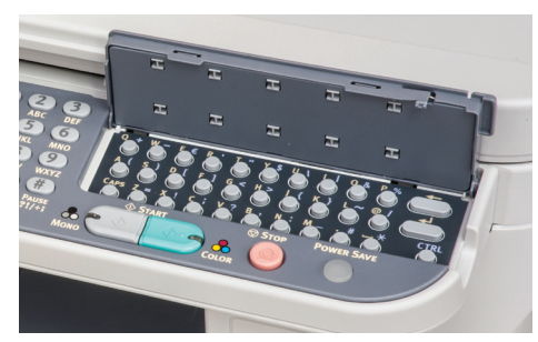
Full QWERTY keyboard (behind 1-Touch key panel)

¹ Power Save button must be pressed to awaken unit from Deep Sleep mode; Auto Power Off is user-configurable (4-hour default). ² Published performance results based on simplex printing of letter-size sheets in laboratory testing. Individual results may vary.