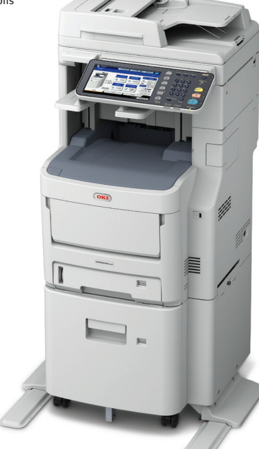
MPS4242mcfx – Up to 42 ppm Color/Mono<sup>1</sup>; 2,630-sheet standard paper capacity, upgradable to 3,160 sheets; 50-sheet in-line stapler