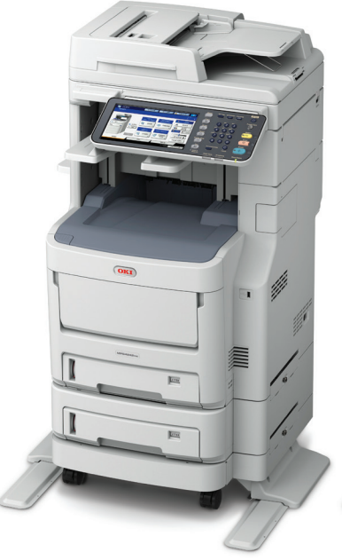
MPS4242mcf – Up to 42 ppm Color/Mono<sup>1</sup>; 1,160-sheet standard paper capacity, upgradable to 1,690 sheets; 50-sheet in-line stapler

9" touch-screen display: simplifies navigation, enhances user productivity, enables access to web-based applications