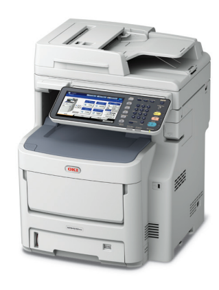
MPS4242mc - Up to 42 ppm Color/ Mono<sup>1</sup>; 630-sheet standard paper capacity, upgradable to 3,160 sheets; 20-sheet convenience stapler

Easy-to-access functionality: primary features are simple to locate and access