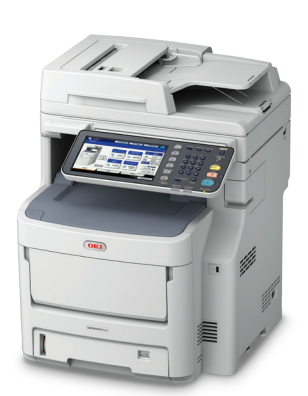
MPS3537mc – Up to 35 ppm Color, 37 ppm Mono<sup>1</sup>; 630-sheet standard paper capacity, upgradable to 3,160 sheets; 20-sheet convenience stapler

And, as new applications become valuable to your business, they can be added to your MFP's feature sets using embedded OKI smart Extendable Platform technology.