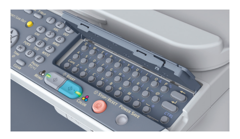
Full OWERTY keyboard (behind lift-open 1-Touch key panel): enables easy entry of email addresses and messages.

Easy-to-read and -use operator panel: ergonomically designed to meet the needs of your workflow environmentkeeping tasks simple and end users more productive. Backlit LCD display tilts up to enhance user productivity.